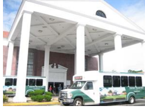
1046 Lyndhurst K

MLS#: F10092022 Status: CS Price: $175,000 SqFt: Beds: 2 Bath: 2 (2 0)