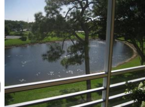
315 Grantham A Unit#315

MLS#: R10370453 Status: CS Price: $126,750 SqFt: 1,000 Beds: 2 Bath: 2 (2 0)