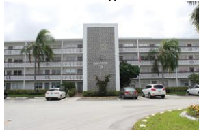
1026 Oakridge D Unit#1026

MLS#: A10328538 Status: CS Price: $123,000 SqFt: 1,000 Beds: 2 Bath: 2 (2 0)