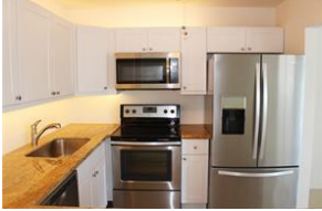
4062 Berkshire D Unit#4062