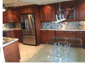
2090 Oakridge U Unit#2090

MLS#: F10077956 Status: CS Price: $177,500 SqFt: Beds: 2 Bath: 2 (2 0)