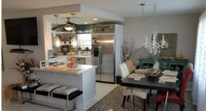
3101 OAKRIDGE V Unit#3101

MLS#: F10087351 Status: CS Price: $140,000 SqFt: Beds: 2 Bath: 2 (2 0)