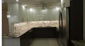
4048 Berkshire C Unit#4048

MLS#: R10436817 Status: CS Price: $142,500 SqFt: 1,000 Beds: 2 Bath: 2 (2 0)